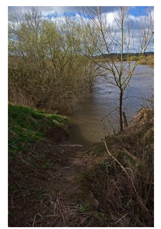
Photo 6: The confluence of Hatfield Brook and the River Severn in Kempsey village. Objective 4 – To maintain, improve and expand community and <u>recreation facilities</u>

Comment [Robert Ga27]: It is the land leading and around the confluence which is relevant not the confluence itself!