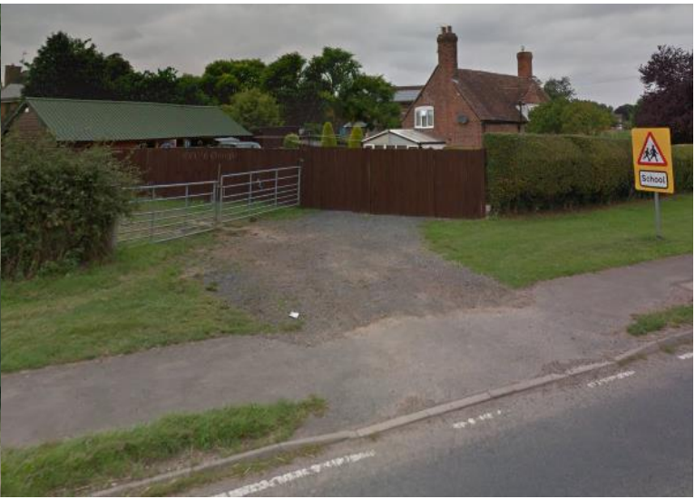
'Parcel 1 Primary Access'