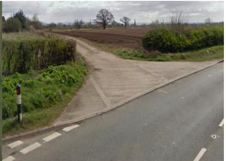
'Parcel 2 Access'

Environment Agency Flood Risk mapping for land-use planning, indicates that the majority of the site is located in Flood Risk Zone 1. The east part of the site is included within Flood Risk Zone 2 and 3 and these areas of flood risk will not be developed on if an allocation were to come forward.