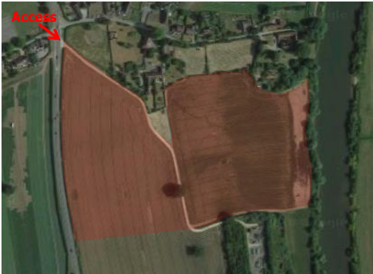
'Parcel 2 in Block Red'

The site at circa 7.5 hectares is located adjacent to Hanley Castle's settlement boundary to the north. To the north of site is Herbert's Farm and Ballards Farm which contain a series of listed buildings and a scheduled ancient monument.