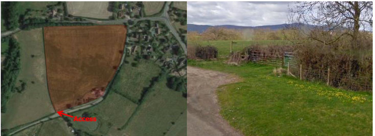
'Parcel 6 in Block Red'

The site at circa 4 hectares is located to the north west of Hanley Castle's settlement boundary. The site is bounded by the B4211 to the north and Gilberts Lane to the east, where there are a series of existing dwellings which form the edge of the settlement boundary. To the south is an existing dwelling and a series of outbuildings which front Gilberts Lane adjacent to the site.