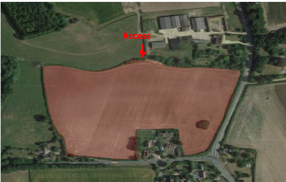
'Parcel 5 in Block Red'

The site at circa 5.9 hectares is located to the north of Hanley Castle's settlement boundary. To the south is a private drive to existing residential dwellings. To the north is Merevale Farm and to the west is Parsonage Farm. The site is bounded by the B4211 to the east.