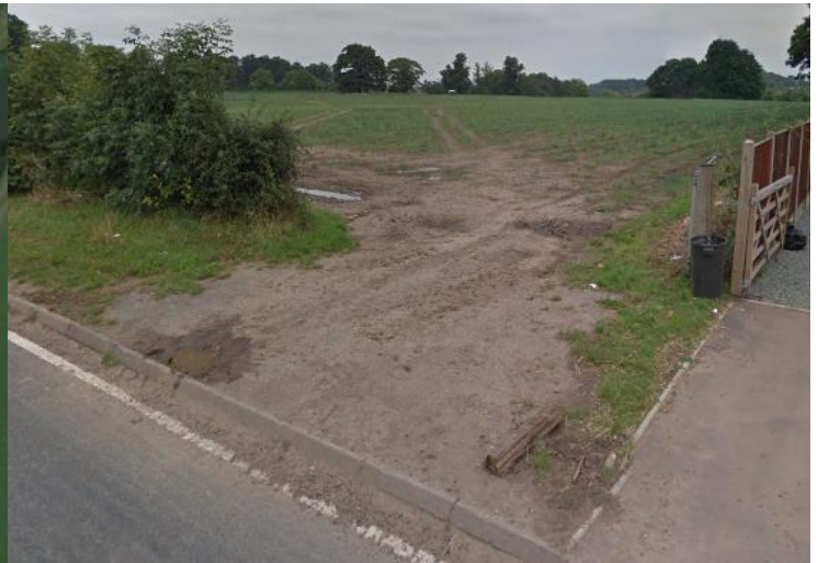
'Parcel 3 Access'

Environment Agency Flood Risk mapping for land-use planning, indicates that the majority of the site is located in Flood Risk Zone 1. Similar to parcel 2, the east part of the site is included within Flood Risk Zone 2 and 3 and these areas of flood risk will not be developed on if an allocation was to come forward.