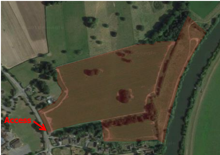
'Parcel 3 in Block Red'

The site at circa 11 hectares is located to the east of Hanley Castle's settlement boundary, where Church End Farm is found. The high school's playing fields are allocated as green space and are located to the west, and existing residential development can be found on Quay Lane, located to the south of the site's boundary.