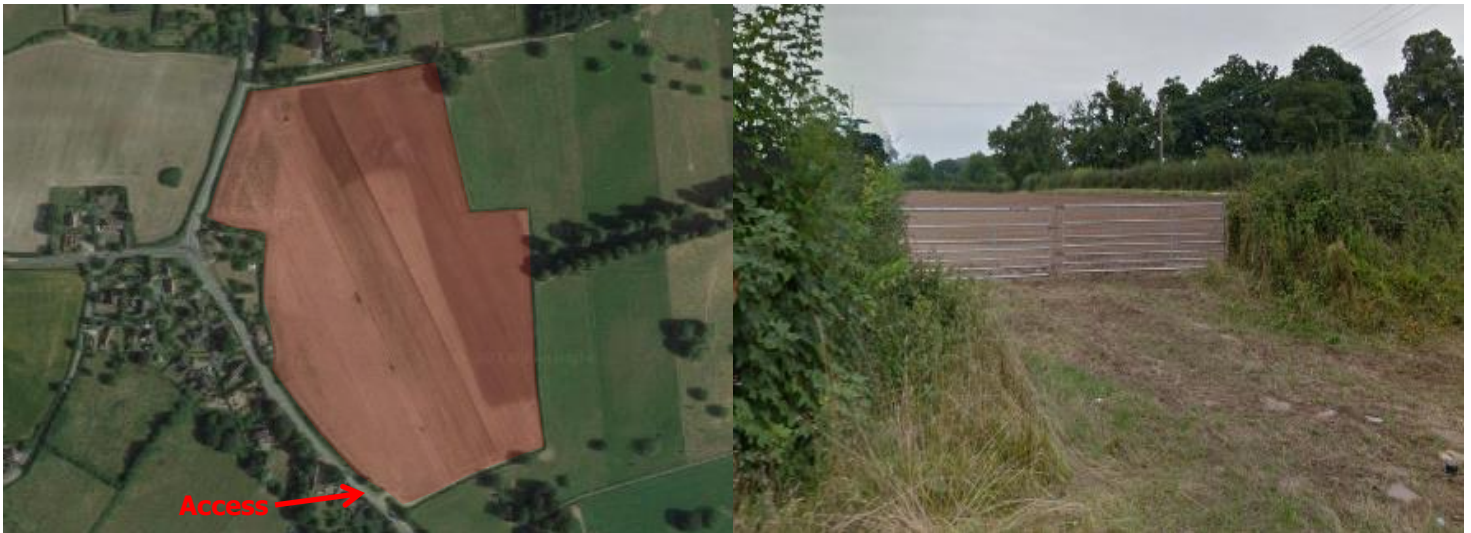
'Parcel 4 in Block Red'

The site at circa 10 hectares is located to the north east of Hanley Castle's settlement boundary. To the west is an existing residential dwelling and the Church of Good Shepherd, and to the south Severn End Lodge can be found.