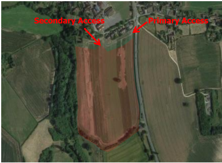
'Parcel 1 in Block Red'

The site at circa 9 hectares is located adjacent to Hanley Castle's settlement boundary, where there is existing housing located to the north. The northern part of the site is located adjacent to the Conservation Area.