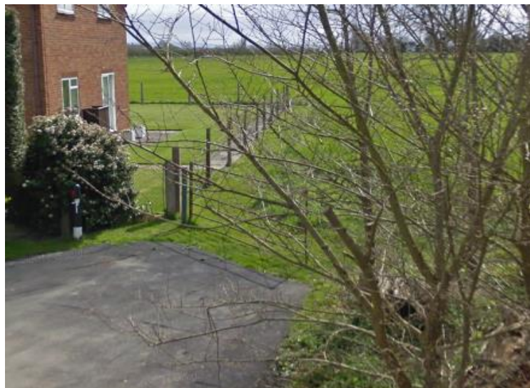
'Parcel 1 Secondary Access'