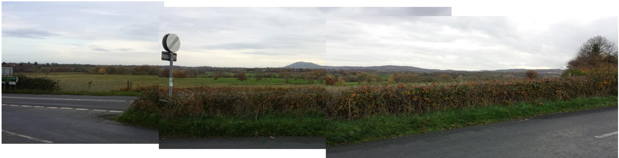
5. Layby A44 200m eastward from #4 above (panning from eastwards to south) OS Grid reference SO 771 555