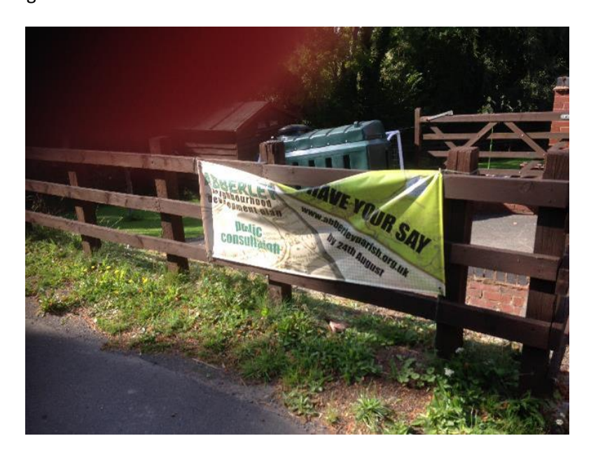
Display banner advertising the consultation