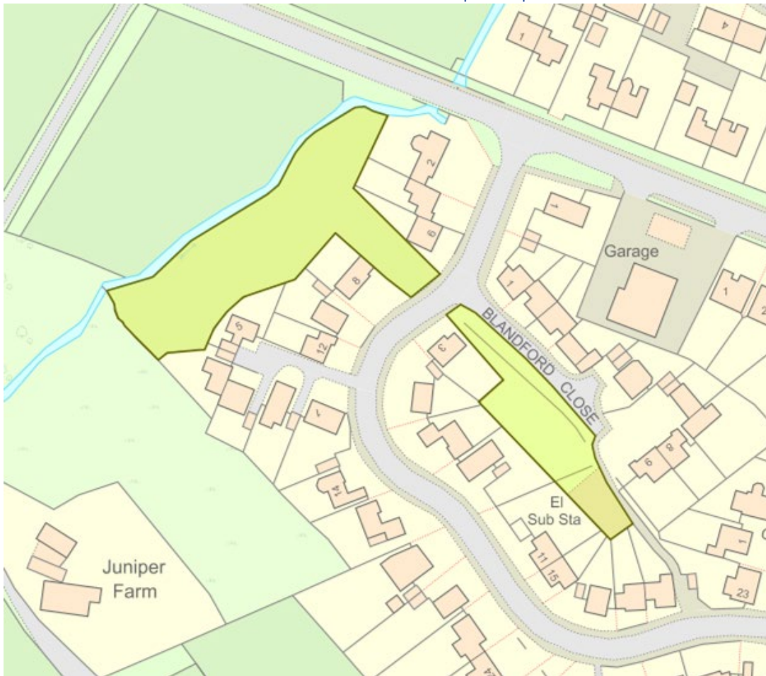
FIGURE 9 GIFFARD DRIVE AND BLANDFORD CLOSE OPEN SPACES