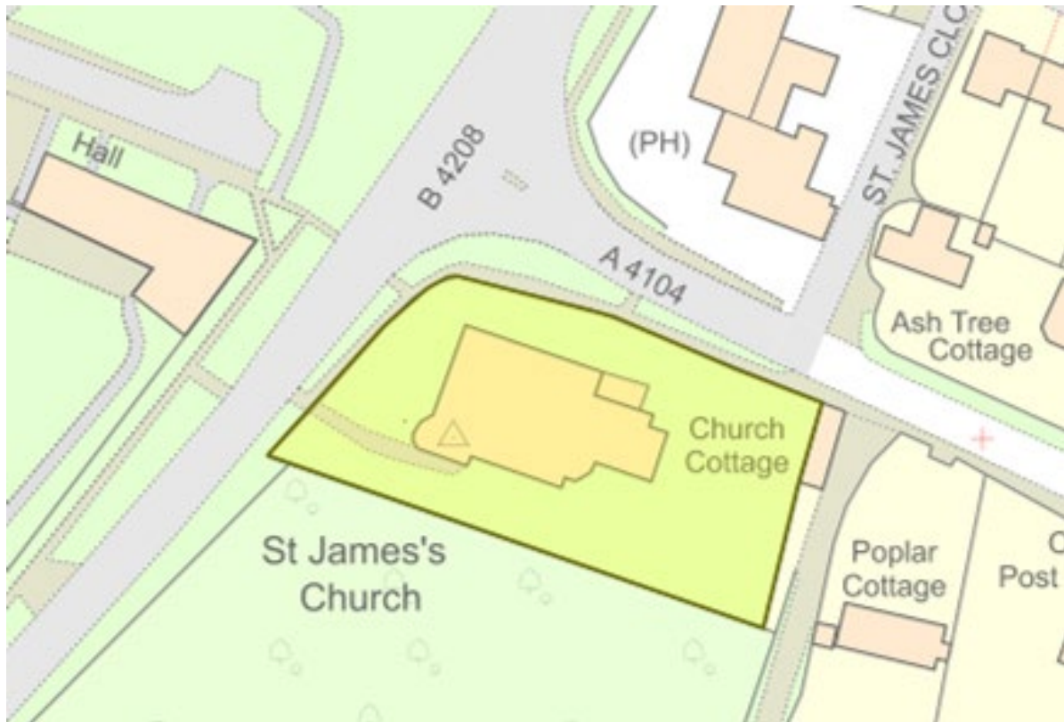
FIGURE 3 WNOS 01 ST JAMES' CHURCH YARD