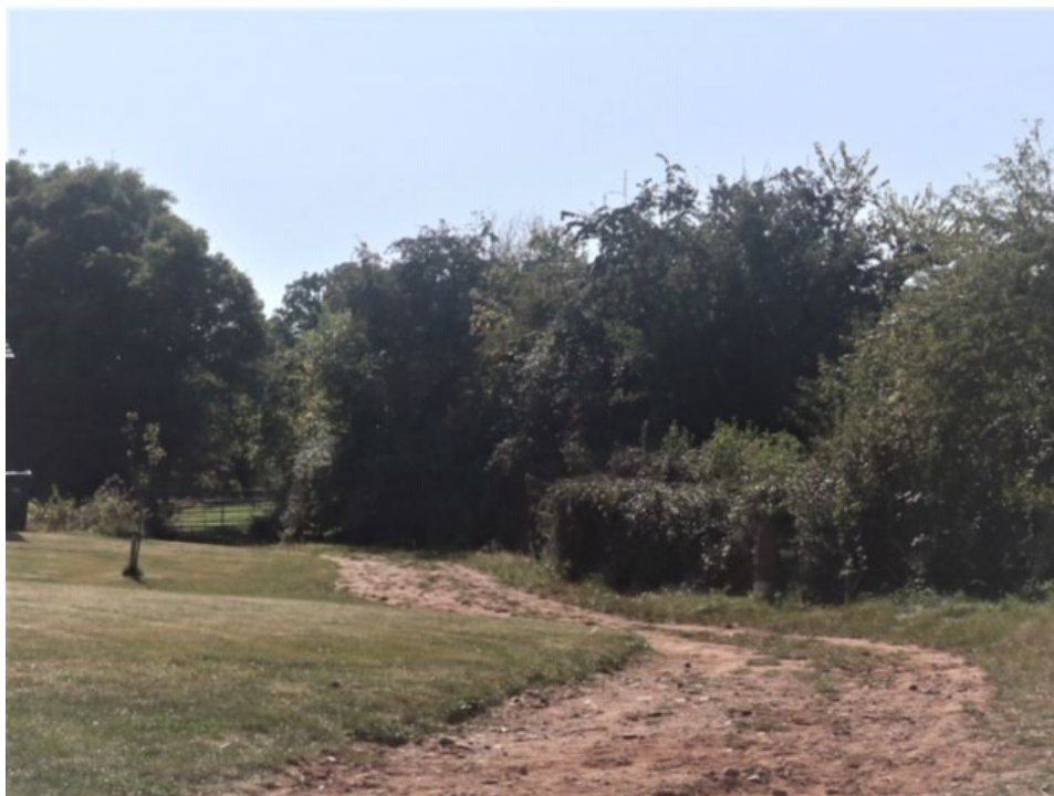
FIGURE 6 SPRING MEADOWS SSSI BUFFER LOOKING SOUTH