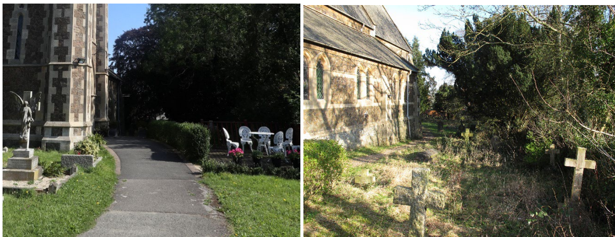
FIGURE 4 CHURCHYARD LOOKING SOUTH FROM GLOUCESTER ROAD