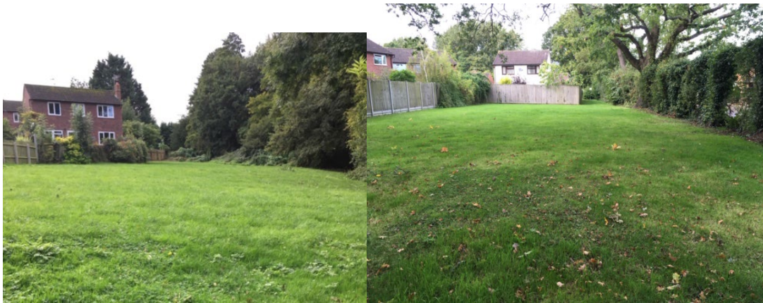
FIGURE 10 GD FACING SE BC FACING NW.