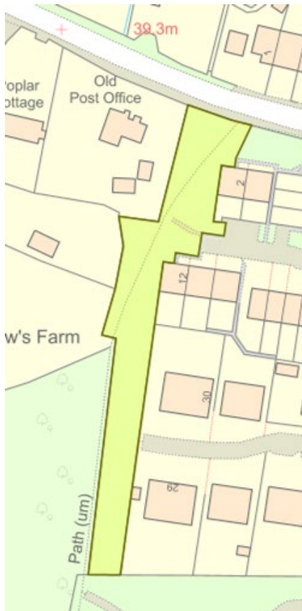
FIGURE 5 SPRING MEADOWS SSSI BUFFER