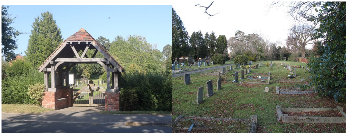
FIGURE 8 WELLAND CEMETERY LOOKING N.