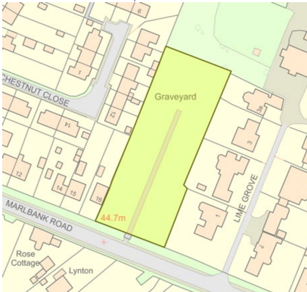
FIGURE 7 WELLAND CEMETERY