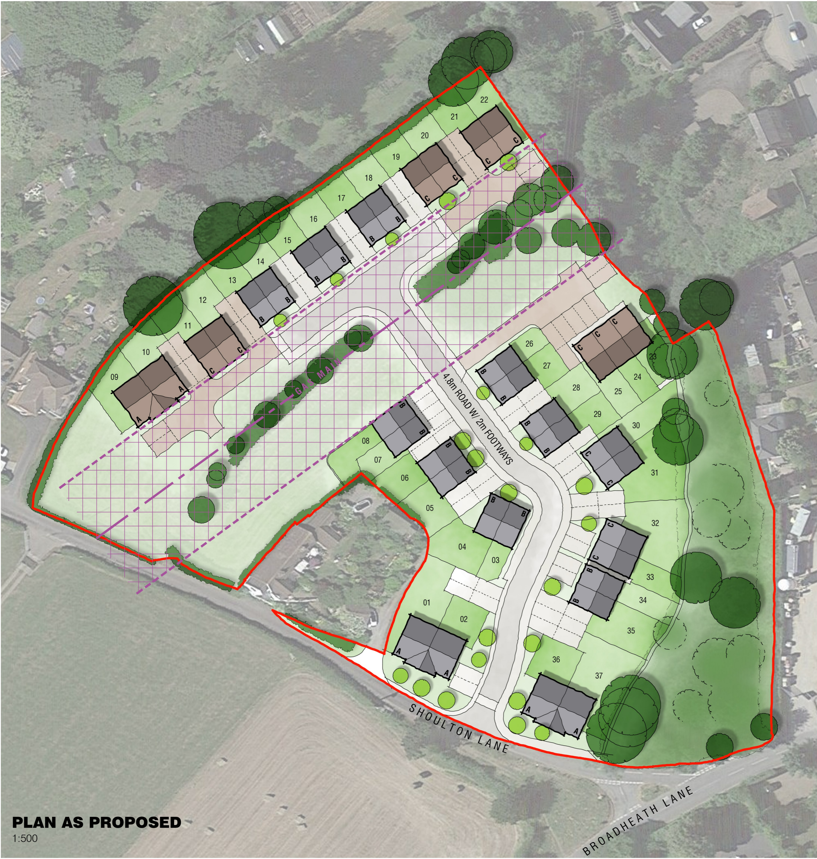
PLAN AS PROPOSED 1:500

NOTES: © COPYRIGHT UMAA ARCHITECTURE LTD. DO NOT SCALE FROM THIS DRAWING. USE FIGURED DIMENSIONS ONLY. CONTRACTORS TO CHECK CRITICAL DIMENSIONS RELATIVE TO THEIR WORK AND REPORT ANY DISCREPANCIES TO THE ARCHITECT.