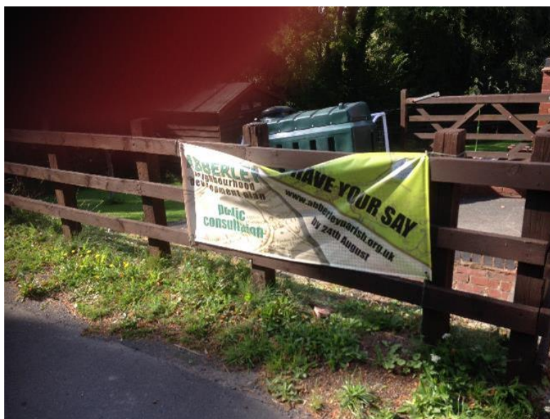
Display banner advertising the consultation

5.4 At the start of the consultation period a flyer was hand-delivered to households and businesses throughout the Neighbourhood Area by volunteers. This explained how and where the draft NDP could be viewed and invited comments. Posters were placed in the parish noticeboards, telegraph poles and windows and at the Manor Arms; and banners were displayed in prominent locations around the Neighbourhood Area.