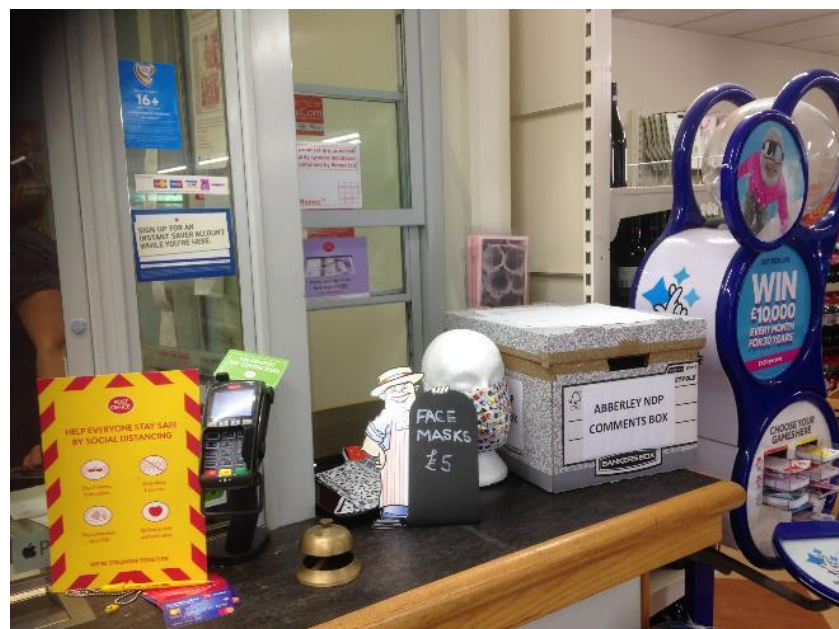
Collection box for comment forms, Abberley Village Stores