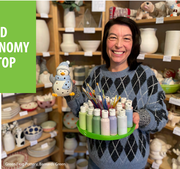
Green Frog Pottery, Barnards Green